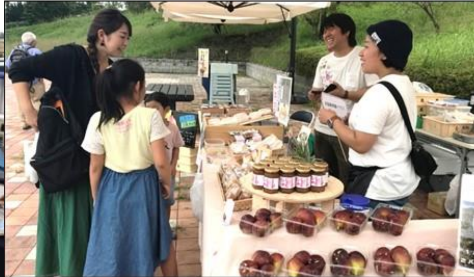
With local farmers/producers