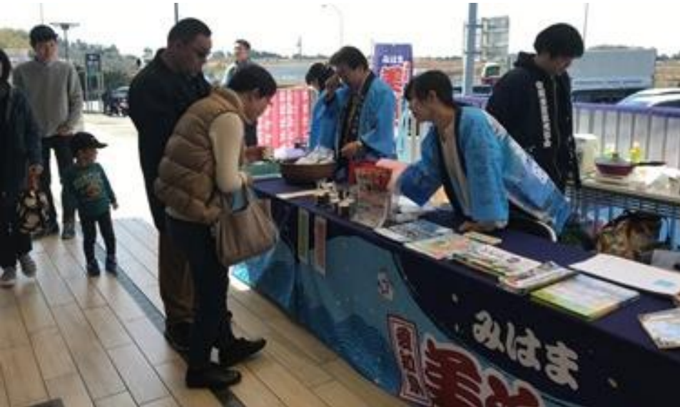
With neighboring municipalities