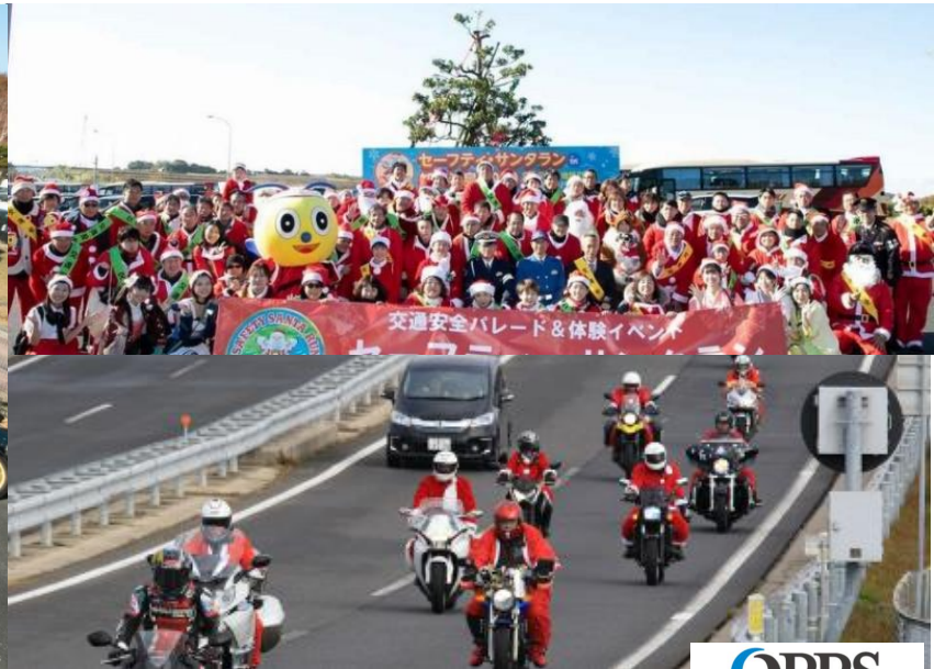
Santa Run (Traffic safety & regional PR with motorcycles / cars)